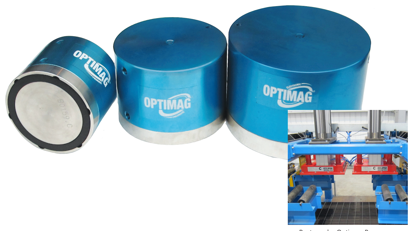
Rectangular Optimag P

Pneumatically switched permanent magnet supplied as a modular system in 5 standard sizes, with either fine or coarse pole magnetic configuration. Choice of pole configuration depends on the material to be held.